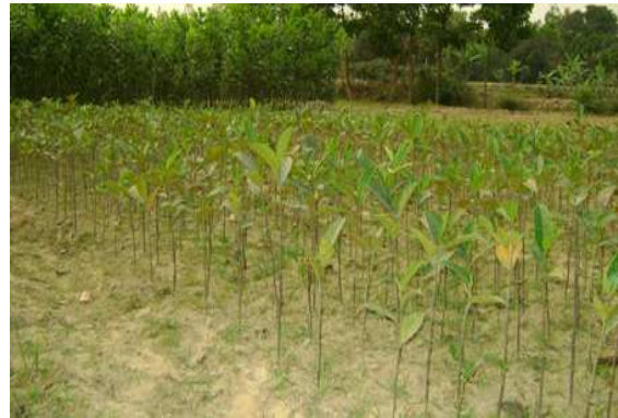
Infant Jackfruit trees