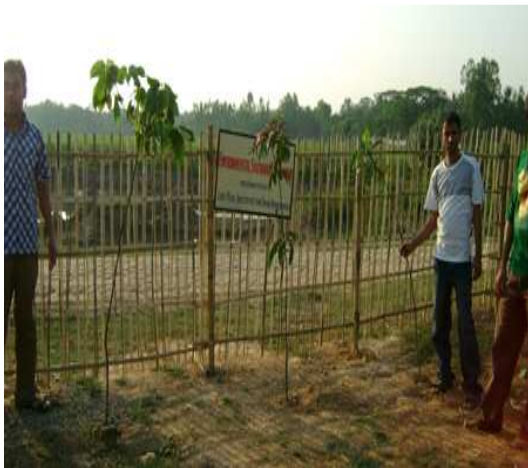
Fruit planation: Boroï