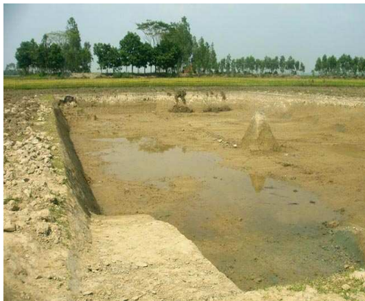
Earth taken from here to raise land and use this as Fish Pond