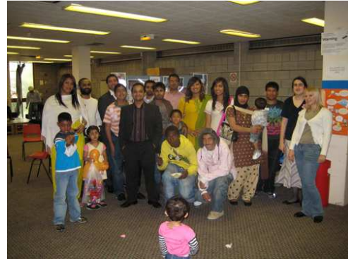
LIF Team and Volunteers