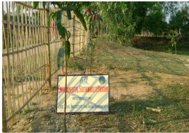
Fruit planation: Mangos, pears