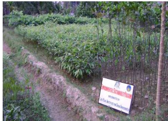
Ready to be transported