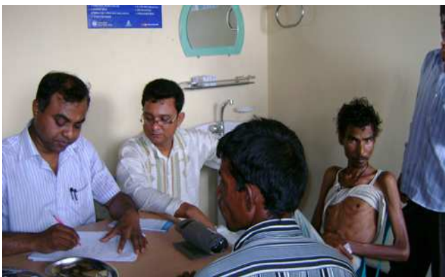
Doctor and patient