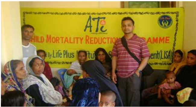
Group of patients in the waiting room