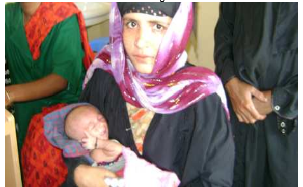
Mother and her infant waiting to be seen