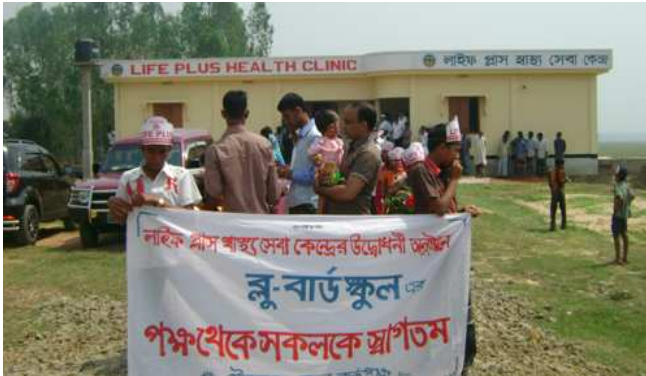
School children getting ready to welcome the Minister