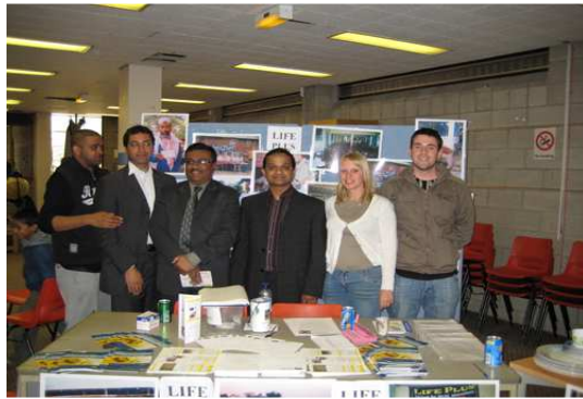
Volunteers and Asst High Com of Bangladesh