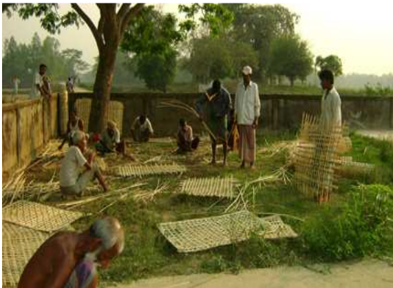
A team work