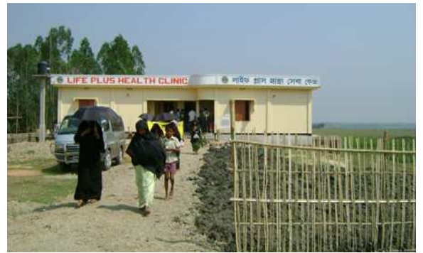
Patients leaving the Clinic