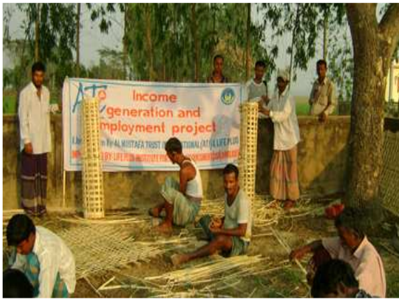
Tree protection cage making