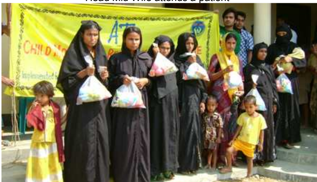
High energy food packs for new mothers & expecting mothers