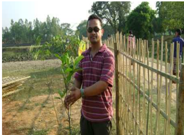
Fruit planation: Jackfruit