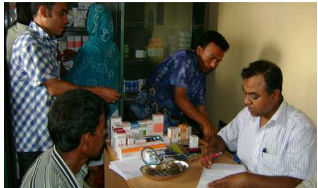
Doctor and patient consultation