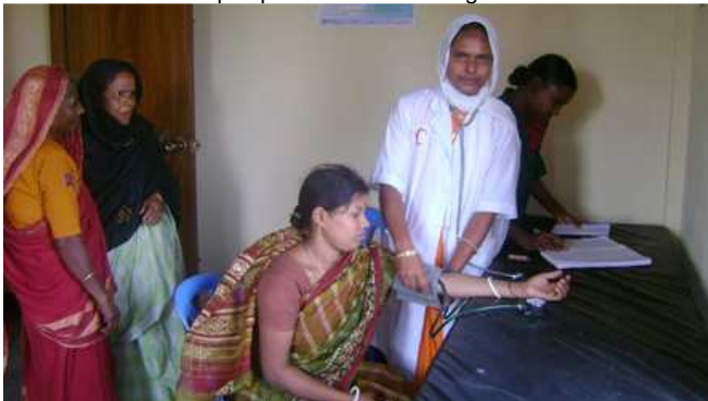
Head Mid Wife attends a patient