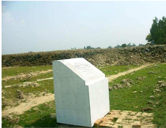
Foundation Stone for the Secondary School