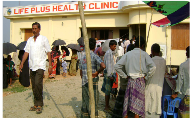
Queues outside the clinic