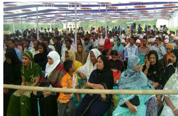
Listening to the speeches after the Opening