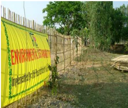
Fruit planation: Mangos

We have donated saplings to local schools, mosques, madrashas and have planted some at the Life Plus Clinic court yard. Cost: to plant a fruit tree it cost a total of £1 this includes: plant & transport from the nursery, Bamboo cage and manpower for planting.