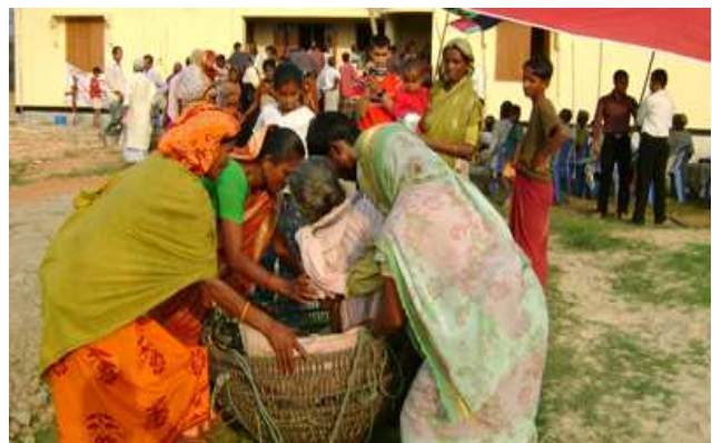
Patient being carried on a basket