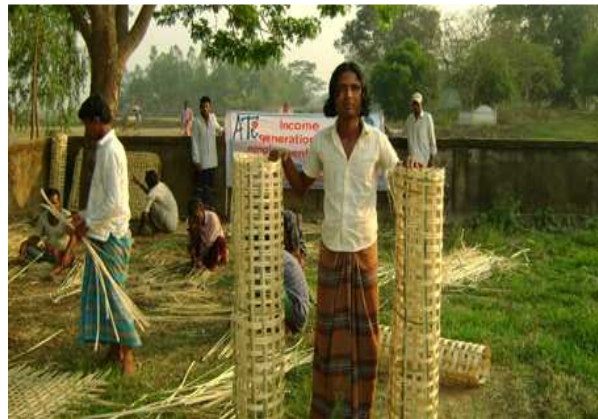
Some ready made cages on display