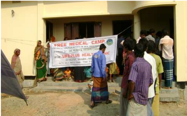
People entering the clinic to see the doctors/nurses