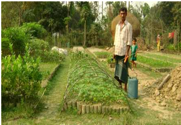
Watering and feed the saplings