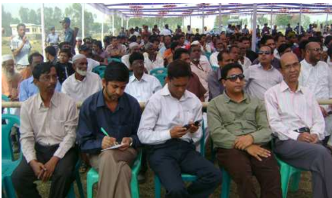
Listening to the speeches -Journalist from Print & TV and Public